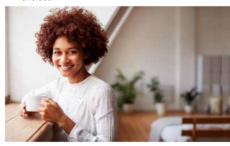
If you are ready to start your journey, contact us to schedule an assessment.

CREOKS is a strong ally in the road to recovery. A person's success requires active participation and taking responsibility for making appropriate choices.